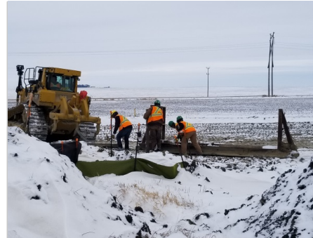
Photo facing North West. SF 15 West side of the road. Excavator is removing half the approach and geo cloth.